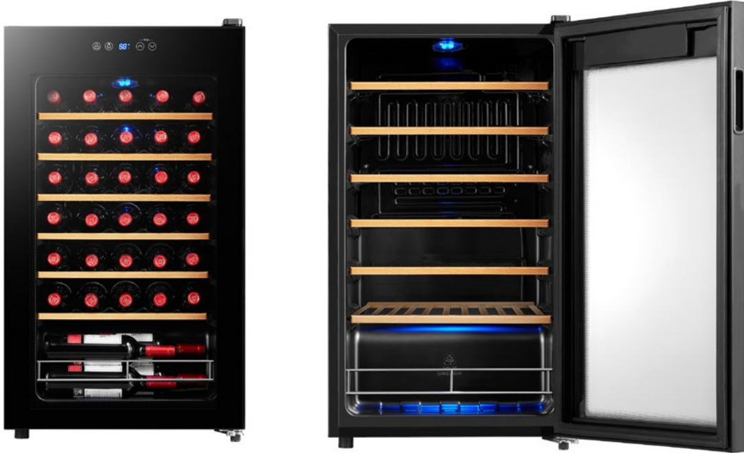
Black Trim Shown