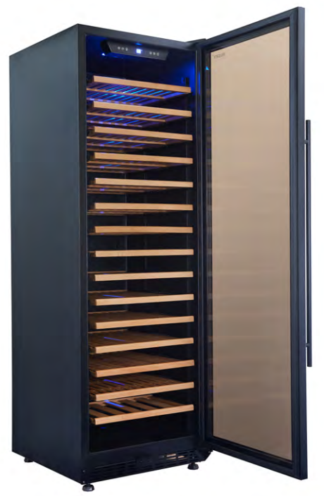
Black Trim Shown