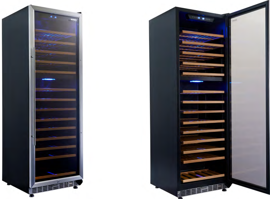
Stainless Steel Trim Shown