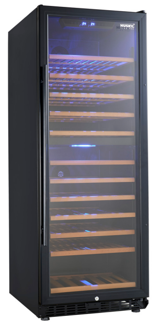
Black Trim Shown